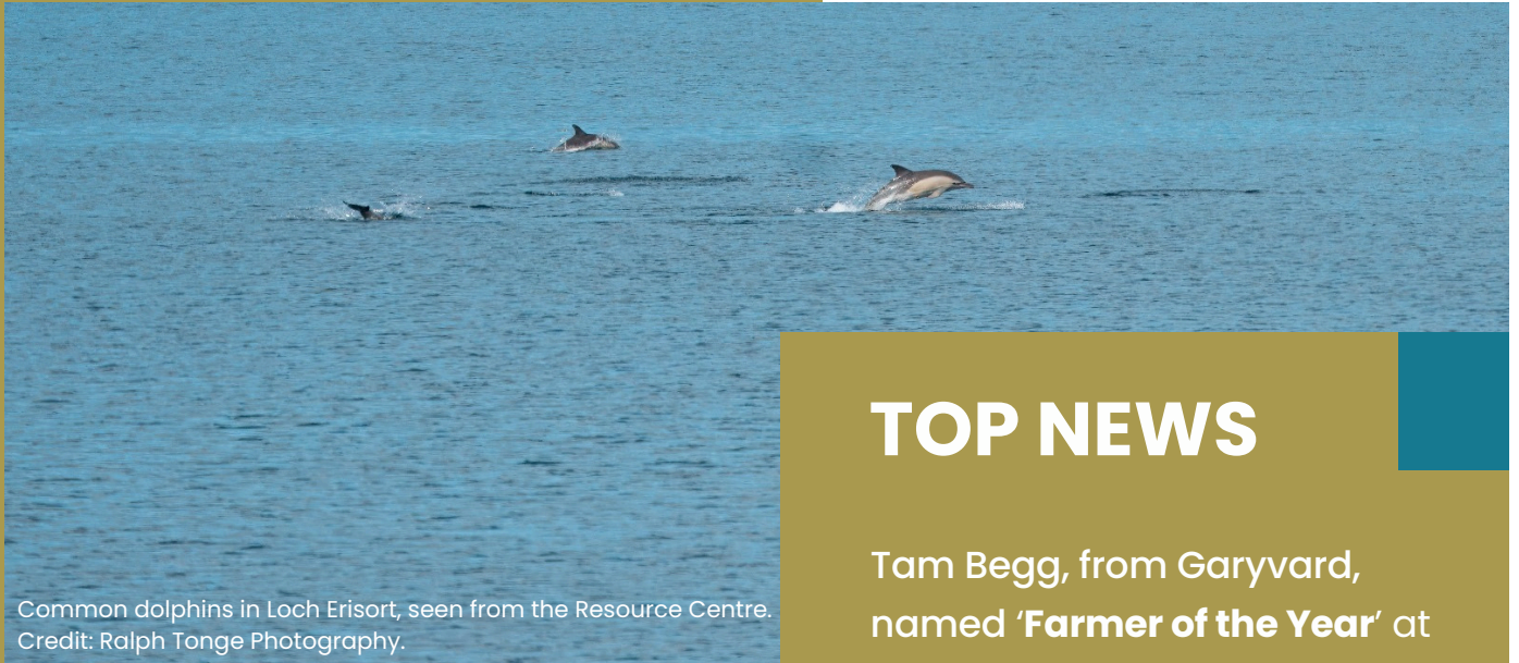
Common dolphins in Loch Erisort, seen from the Resource Centre.