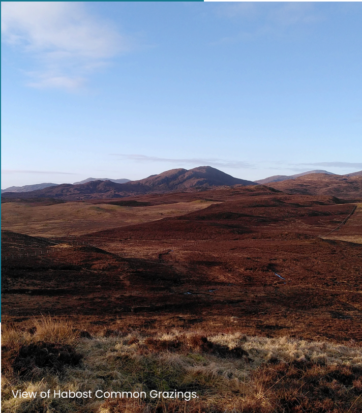
View of Habost Common Grazings.